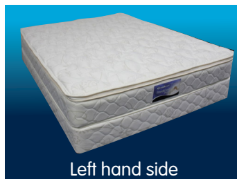
Left hand side

3. Full Bed Photo: We require a photograph of your entire bed – taken from a small distance away, but ensuring that the entire bed is in the photograph. Ideally, we would like photographs from at least 3 different angles – left hand side, right hand side and foot end of the bed.