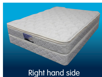
Right hand side